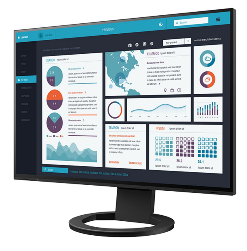
The 24.1-inch FlexScan EV2495 is a USB Type-C docking monitor with daisy chain capability for streamlining hot desking and remote working.